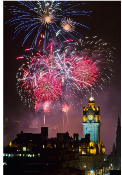
Fireworks at the Edinburgh Festival

PS Did you know that the biggest firework display in Europe happens in Edinburgh where a million fireworks are set off in under an hour!